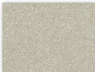
▲ 610 - Combed Cotton