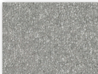
▲ 930 - Glacier Bay