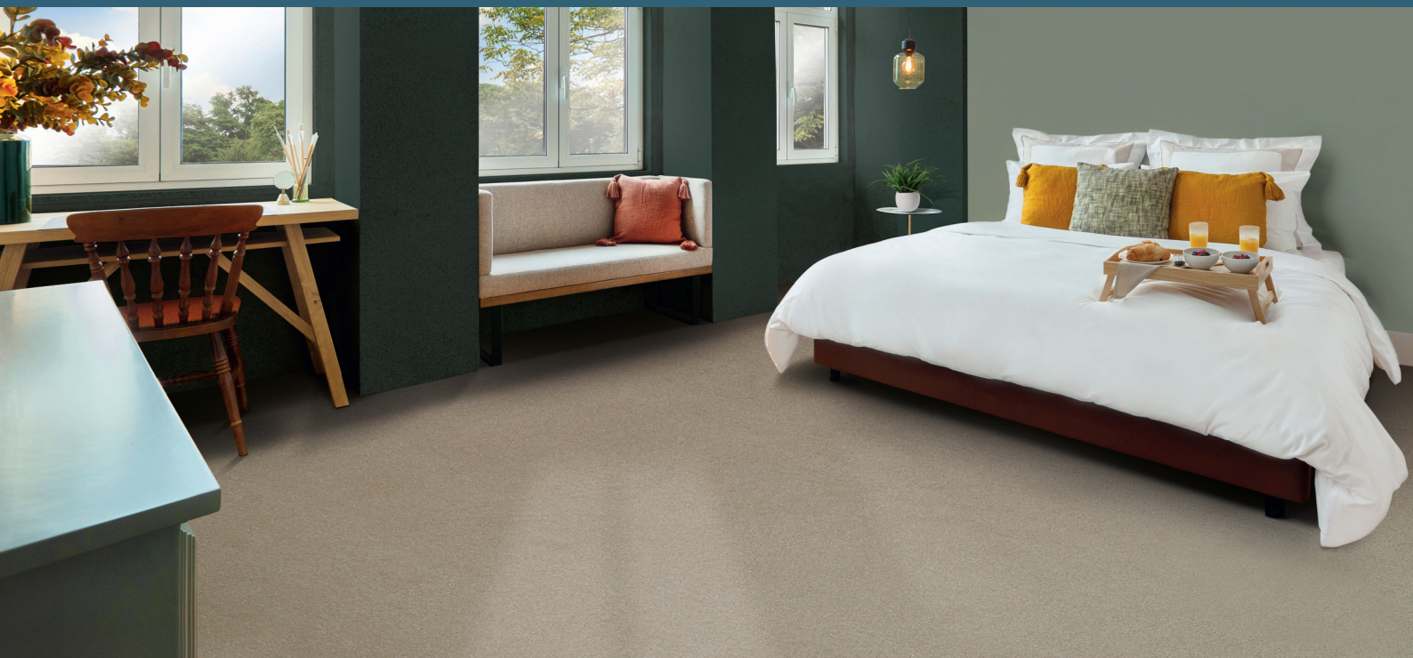
▲ 640 - Frosted Dawn