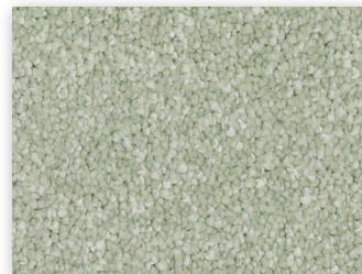
▲ 450 - Fresh Sage