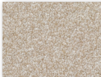
▲ 680 - Toasted Marshmallow