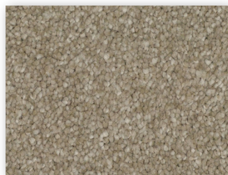
▲ 700 - Driftwood