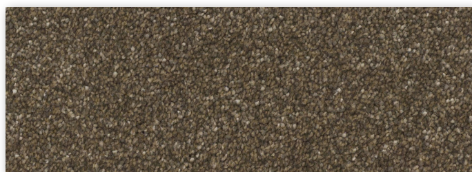
▲ 800 - Bear Cub