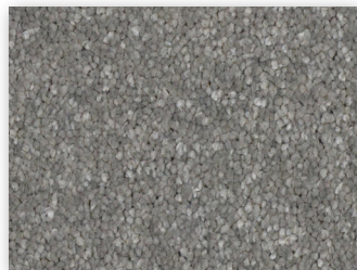
▲ 940 - Stepping Stone