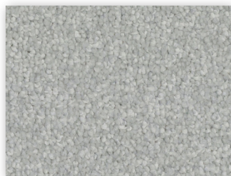
▲ 910 - Silverpoint