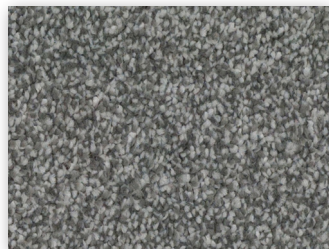
▲ 950 - Cityscape