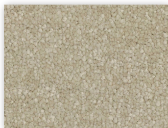
▲ 640 - Frosted Dawn