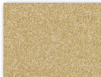
▲ 240 - Glorious Gold