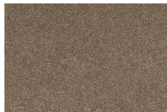
▲ Soft Hemp