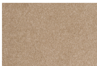
▲ Soft Fudge