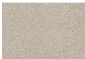
▲ Smoked Pearl