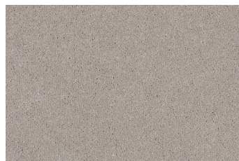
▲ Energetic Grey