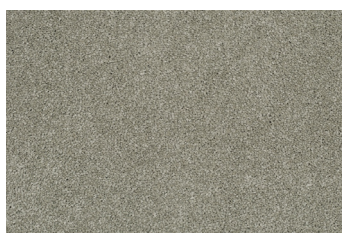
▲ Arctic Green