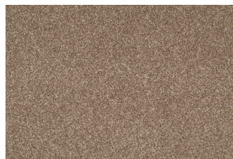
▲ Salted Beige