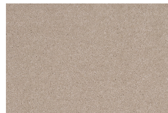
▲ Rewind Cream