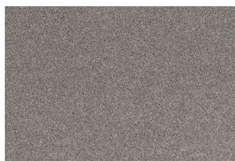
▲ Misty Harbour