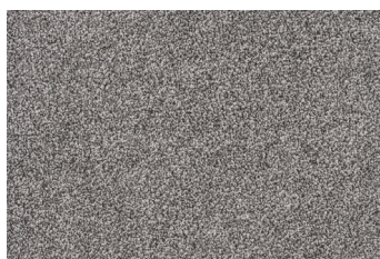
▲ Summer Shadow